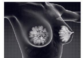
MÅTTE FJERNES: Dette datagenererte bilde vist i få sekunder i videoen på Facebook.