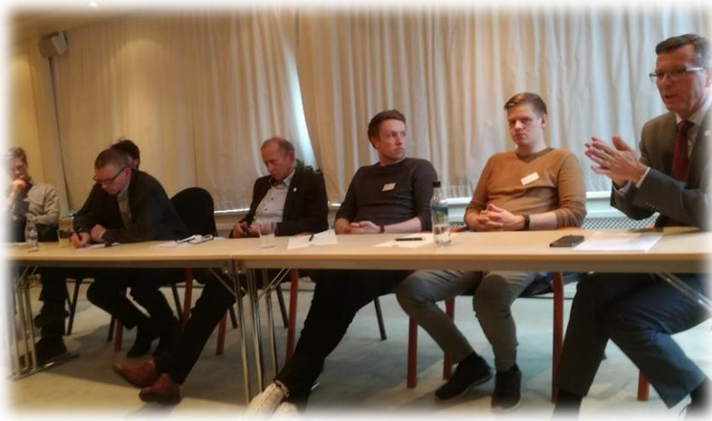
The debate panel in action.